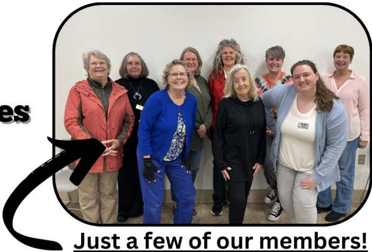
Just a few of our members!